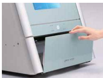
Tank cover folds flat for easier access

Save valuable time with the DWX-43W's automated maintenance features. Auto-rinse prevents contamination, sticking, and drying, maintaining clean and efficient production. Automatic correction ensures accurate milling while saving hours of manual calibration. With an improved waterflow system, milling burs and other device parts stay cleaner for longer with no need for costly filter consumables. In addition, the included Virtual Panel software (VPanel for DWX) seamlessly provides maintenance oversight and output performance control.