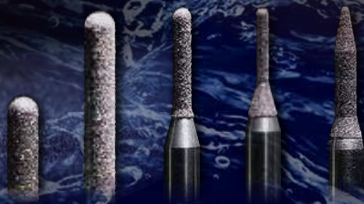
DGSHAPE genuine diamond-coated grinding burs