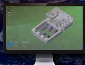
DGSHAPE CAM for DWX-43W