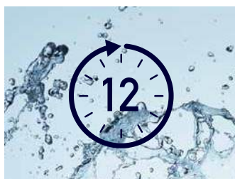
Auto-rinse every 12 hours