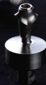
Titanium alloy* *The optional attachment is required.