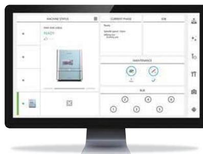
VPanel for DWX